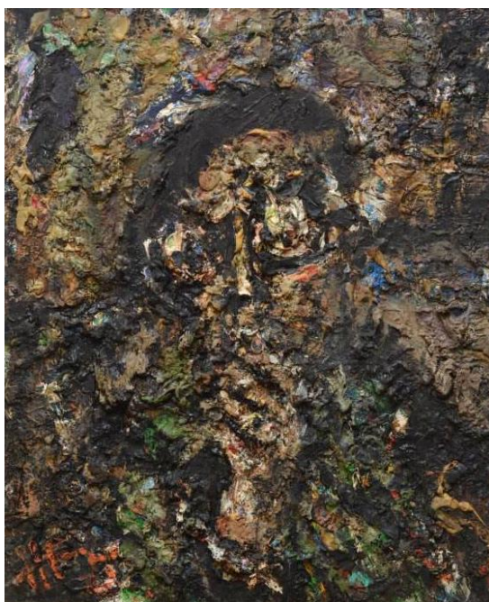
Figure 3 "Self-portrait", 50/61cm., 2004; from the fund of Art Gallery „Nikola Petrov“-Vidin, donation

Frank Auerbach and Ruschukliev obsessed to “gaze” in himself (with a brush in hand).